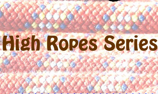
High Ropes Series